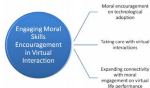
Figure 3. Model of Engaging Moral Skills Encouragement in Virtual Interaction

In addition, the field of ethics which is sensitive to the moral values involves illustrating how users should implement technological tools in addressing ethical framework to strengthen moral engagement in social media interaction. The moral engagement which should be inculcated on the virtual interaction includes equality, justice, property, and privacy. All these can be prioritised in the technological use in the form of user control. Such practices demonstrate an awareness of how information technology allows the human style on social practices which can enhance to form moral basis experiences, for instance friendship, care, commitment, and trust. It is necessary therefore to address the ethical norms relevant to how people engage in friendships online [20]. The connections between technology and human capabilities have been integrated to the feature and design of technology to enable users in utilising appropriately in the way that can be applied properly into the application context.