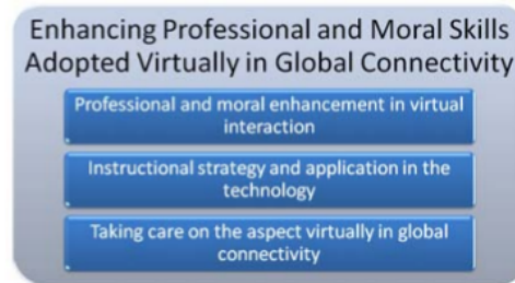
Figure 4. Model Of Enhancing Professional And Moral Skills Adopted Virtually In Global Connectivity

of their range, speed and mapping [13]. It can be described that to determine the characteristics of interaction in a virtual world can be assessed in the virtual environment which is immersed with virtual objects.