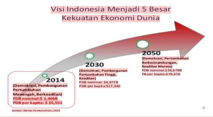
Source 1 Coordinating Minister for Economic Affairs 2010 (in Ikhsan, Muhammad, 2010)

In line with the Indonesian national education policy relating to those embodied in the vision of the global economic mission in 2050 on equitable distribution of the economy including the nation's character education as visualized in the following data sources, to support or support the Grand Reference concept of the Gold Generation of 2045's Educational Character Design (MDG's) above, as follows.