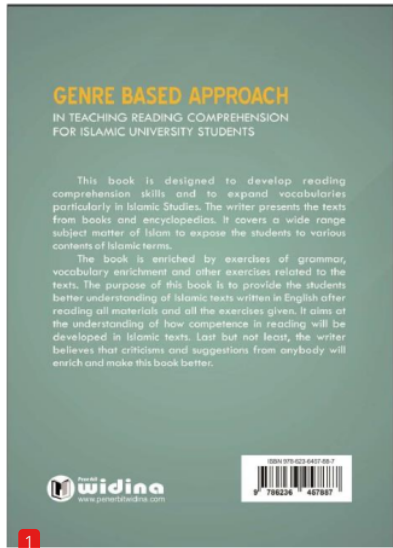
1 Picture 2. The back cover of the book