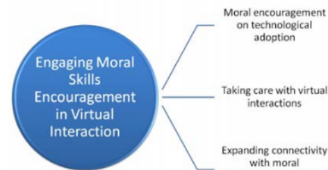
Figure 3. Model of Engaging Moral Skills Encouragement in Virtual Interaction

In addition, the field of ethics which is sensitive to the moral values involves illustrating how users should implement technological tools in addressing ethical framework to strengthen moral engagement in social media interaction. The moral engagement which should be inculcated on the virtual interaction includes equality, justice, property, and privacy. All these can be prioritised in the technological use in the form of user control. Such practices demonstrate an awareness of how information technology allows the human style on social practices which can enhance to form moral basis experiences, for instance friendship, care, commitment, and trust. It is necessary therefore to address the ethical norms relevant to how people engage in friendships online [20]. The connections between technology and human capabilities have been integrated to the feature and design of technology to enable users in utilising appropriately in the way that can be applied properly into the application context.