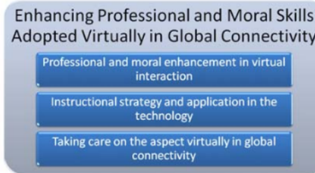
Figure 4. Model Of Enhancing Professional And Moral Skills Adopted Virtually In Global Connectivity

of their range, speed and mapping [13]. It can be described that to determine the characteristics of interaction in a virtual world can be assessed in the virtual environment which is immersed with virtual objects.