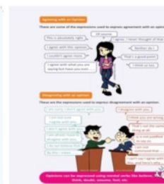
Figure 2. Opinions & thoughts conversation

Students were given vocabulary related to offers and suggestions. They were asked to provide Indonesian translations of the words in order to comprehend the purpose of the material. The teacher assists the student in understanding the material by explaining it in Indonesian and providing examples of each word. The exercise involves replacing missing words in sentences. This material carries out the objectives of knowing the vocabularies of offers and suggestions in order to train students' grammar skills. Additionally, the effect of using an eclectic approach as the learning method was seen in conversation and study groups, the teachers acted as the