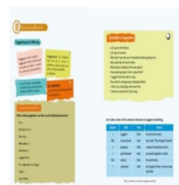
Figure 1. Offers and Suggestions: Vocabulary Review

The first chapter is titled "Offers and Suggestions." The students were divided into several groups in the circle-arranged chair to practice the dialogue before speaking in front of the class. The teacher serves as a facilitator, establishing relationships between students. This material implements the goal of practicing offers and suggestions to improve students' speaking skills. Therefore, the materials in this chapter with an objective aspect meet the criteria of the community language learning method.