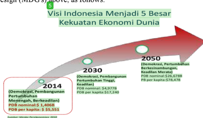
Source 1 Coordinating Minister for Economic Affairs 2010 (in Ikhsan, Muhammad, 2010)

In line with the Indonesian national education policy relating to those embodied in the vision of the global economic mission in 2050 on equitable distribution of the economy including the nation's character education as visualized in the following data sources, to support or support the Grand Reference concept of the Gold Generation of 2045's Educational Character Design (MDG's) above, as follows.