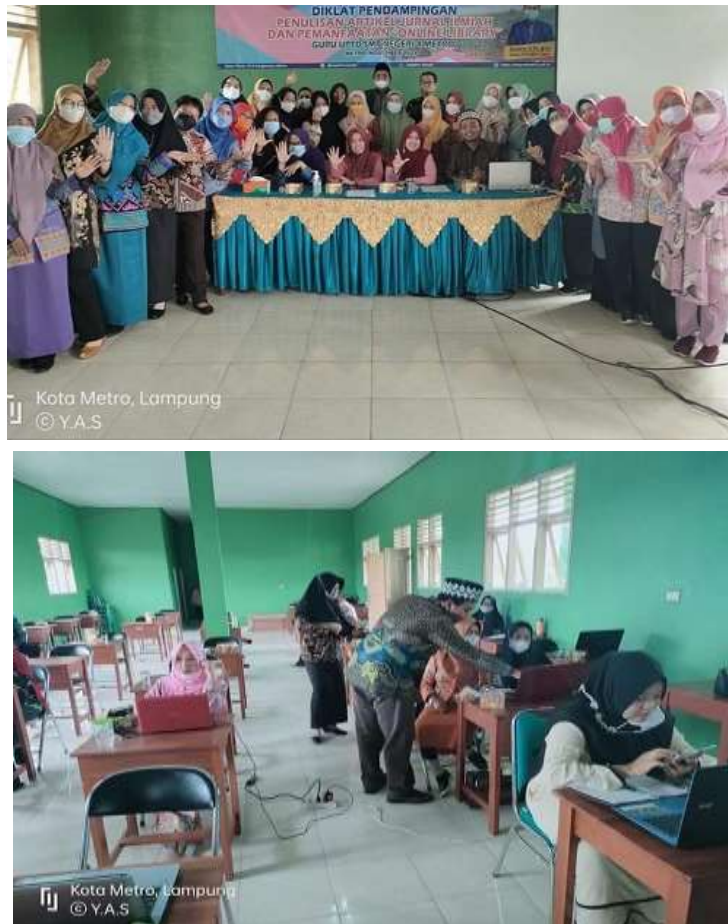
Figure 3, Giving Assistance of Indexing Journals and Library Online for Teachers