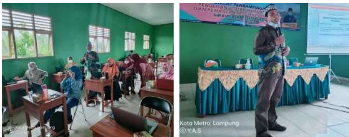
Figure 2. Giving Assistance of Technique of Writing Scientific Articles for Teachers

In the second activity conducted on October 08, 2021 at meeting Room 2nd Floor of State Junior High School (SMPN) 2 Metro. This activity focuses more on the technique of writing scientific articles. There are several tricks that can be done by a writer to enrich