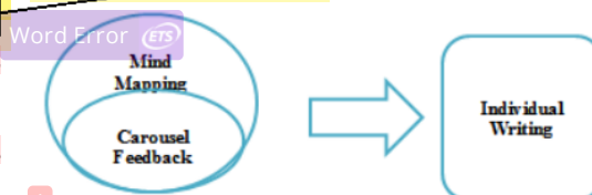
Figure 2. Integrated Techniques (Mind Mapping and Carousel Feedback)

Essentially, the procedures of this integrated technique can be illustrated as follows: